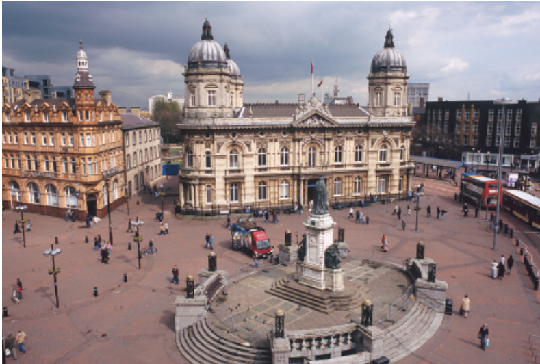
Heart of the city – Queen Victoria Square.