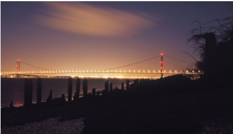
Above: A new dawn – Humber Bridge as first light creeps into the sky.