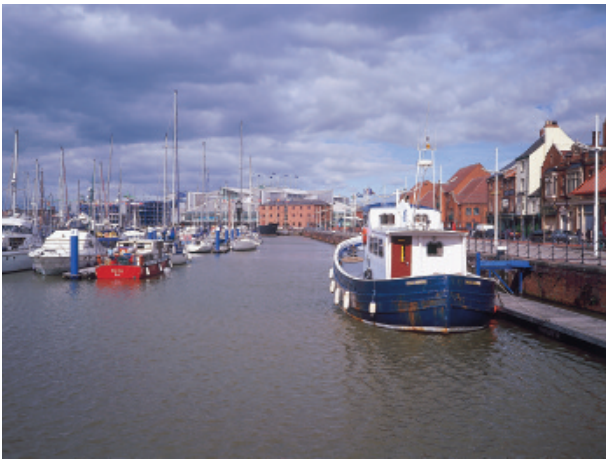
From work to pleasure – Humber Dock and the adjacent Railway Dock have been converted into a successful and attractive marina.